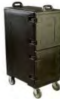
Dbl. Door Insulated Carrier 25" x 17" x 50"