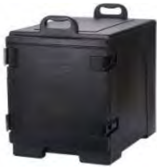
Single Door Insulated Carrier 24" x 17" x 21"