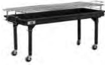
5' Charcoal Grill 60" x 25" x 34"