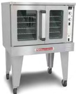
Electric Convection Oven