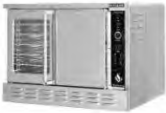
Convection Oven 41" x 40" x 37"