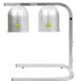
Heat Lamp 12" x 10" x 25"