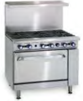
6 Burner Stove