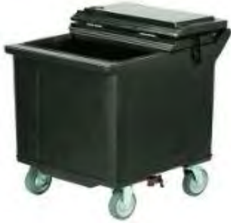
Ice Caddy | 125 lbs. 32" x 23" x 29"