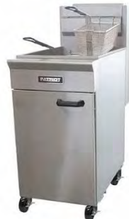
Deep Fryer | Gas