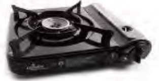
Single Butain Stove