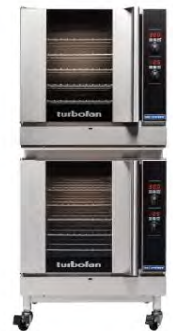
Double Stack Convection Oven