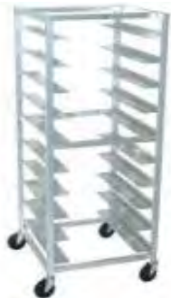
Universal Speed Rack 10 Shelves