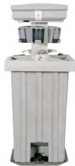
Wash Station | 4 Head