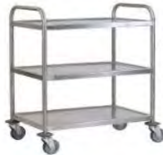
Stainless Steel 3 Tier Cart 24" x 48" x 2"