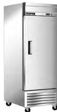
Freezer | 4 Rack