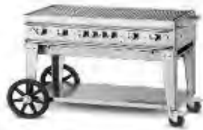
4' Prop Stainless Grill 50" x 23" x 32"