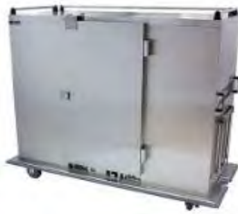
Banquet Cart 150 Cap. 60" x 65" x 26"