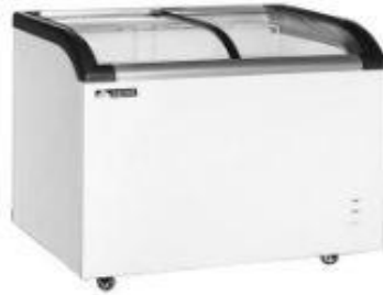
Reach In/Sliding Freezer 29.25" W x 26.7/8" D