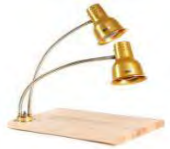
Carving Station | Double 16" x 24" x 18"