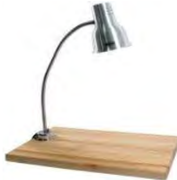
Carving Station | Single 16" x 24" x 18"