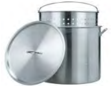
Stock Pot w/Lid 14" x 17 x 14"