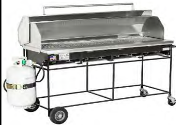
6' Stainless Steel Propane Grill w/Hood